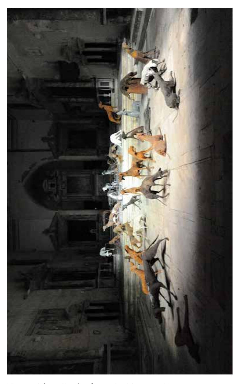
Fig. 3 Velasco Vitali, Sharco, Sant'Agostino, Pietrasanta, 2010