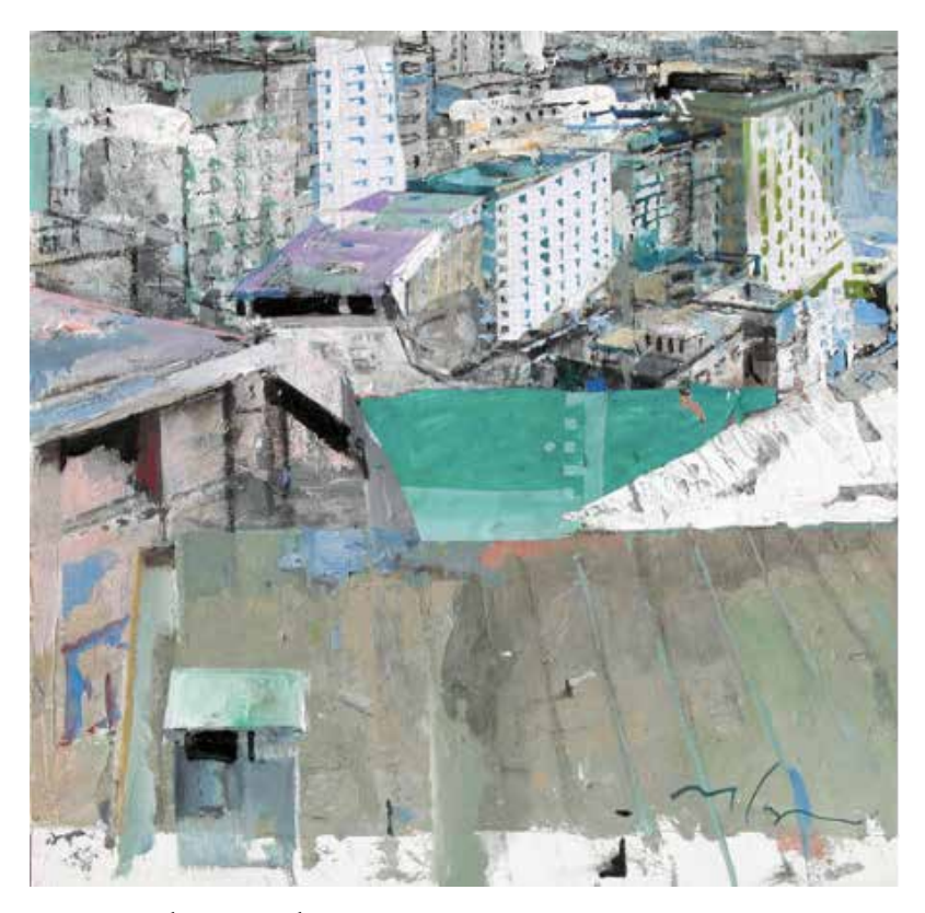
Fig. 2. Velasco Vitali, Genova, 2005