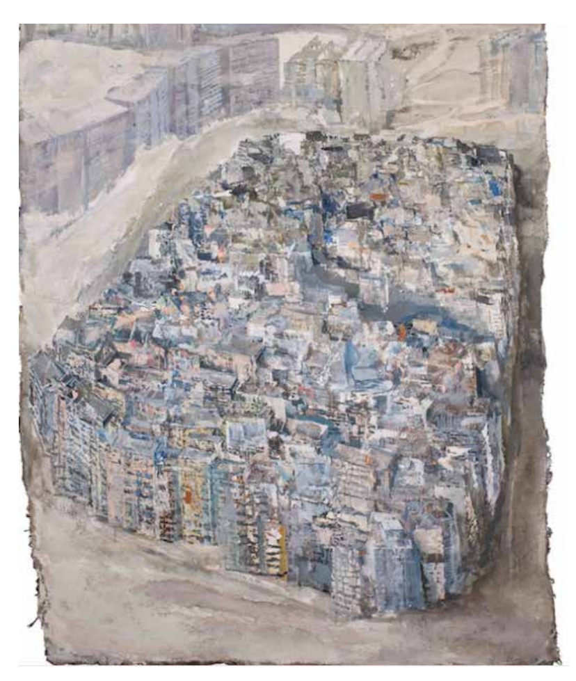
Fig. 1. Velasco Vitali, Kowloon, 2013