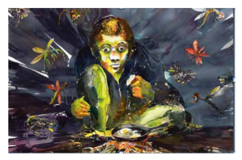
Fig. 5. Santi Moix, The Adventures of Huckleberry Finn, 2011